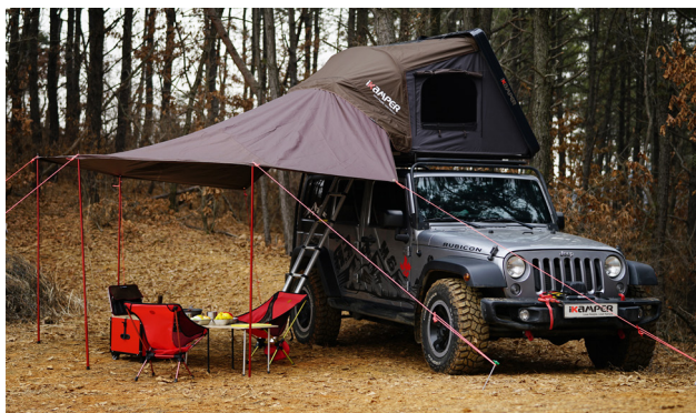
Skycamp 2X with optional Awning.

It took years of hard work, prototypes, testing, failing, re-testing... But finally, we did it. We believe you'll be as proud of owning your Skycamp as we are of creating it.