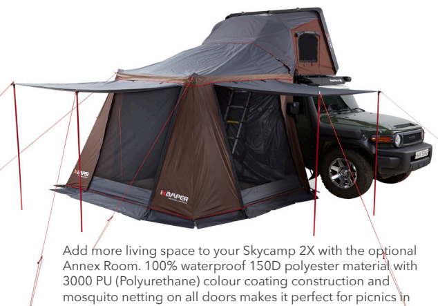
Add more living space to your Skycamp 2X with the optional Annex Room. 100% waterproof 150D polyester material with 3000 PU (Polyurethane) colour coating construction and mosquito netting on all doors makes it perfect for picnics in the heat and rain. (Shown with optional extra canopy poles.)