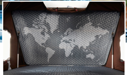
Skycamp 2X opens to a comfy double size mattress.

The Skycamp 2X tent is made of breathable, water-resistant poly-cotton canvas. To really keep you dry, it also comes with waterproof zippers and a rain fly for extra protection. The problem with most tents is that the thin polyester has a vinyl coating, making it less breathable and increasing condensation. The Skycamp's thicker, heavier canvas will keep you dry, and it's also quieter in the wind.