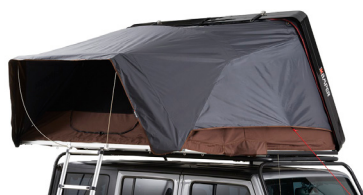
Skycamp 2.0 with optional Airflow Summer Tent fly closed.

It took years of hard work, prototypes, testing, failing, re-testing... But finally, we did it. We believe you'll be as proud of owning your Skycamp as we are of creating it.