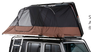
Skycamp 2.0 with optional Airflow Summer Tent fly open.