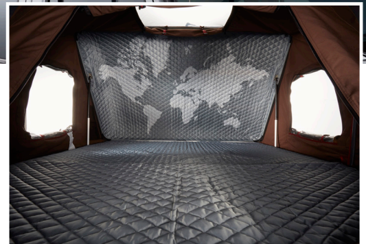
Skycamp 2.0 floor folds out into a comfy king size mattress.

The tent "skin" is just one part of the Skycamp 2.0. It's completely detachable, allowing you to switch it out with our lighter mesh tent in summer or replace the tent after a few years without having to buy a whole new Skycamp.